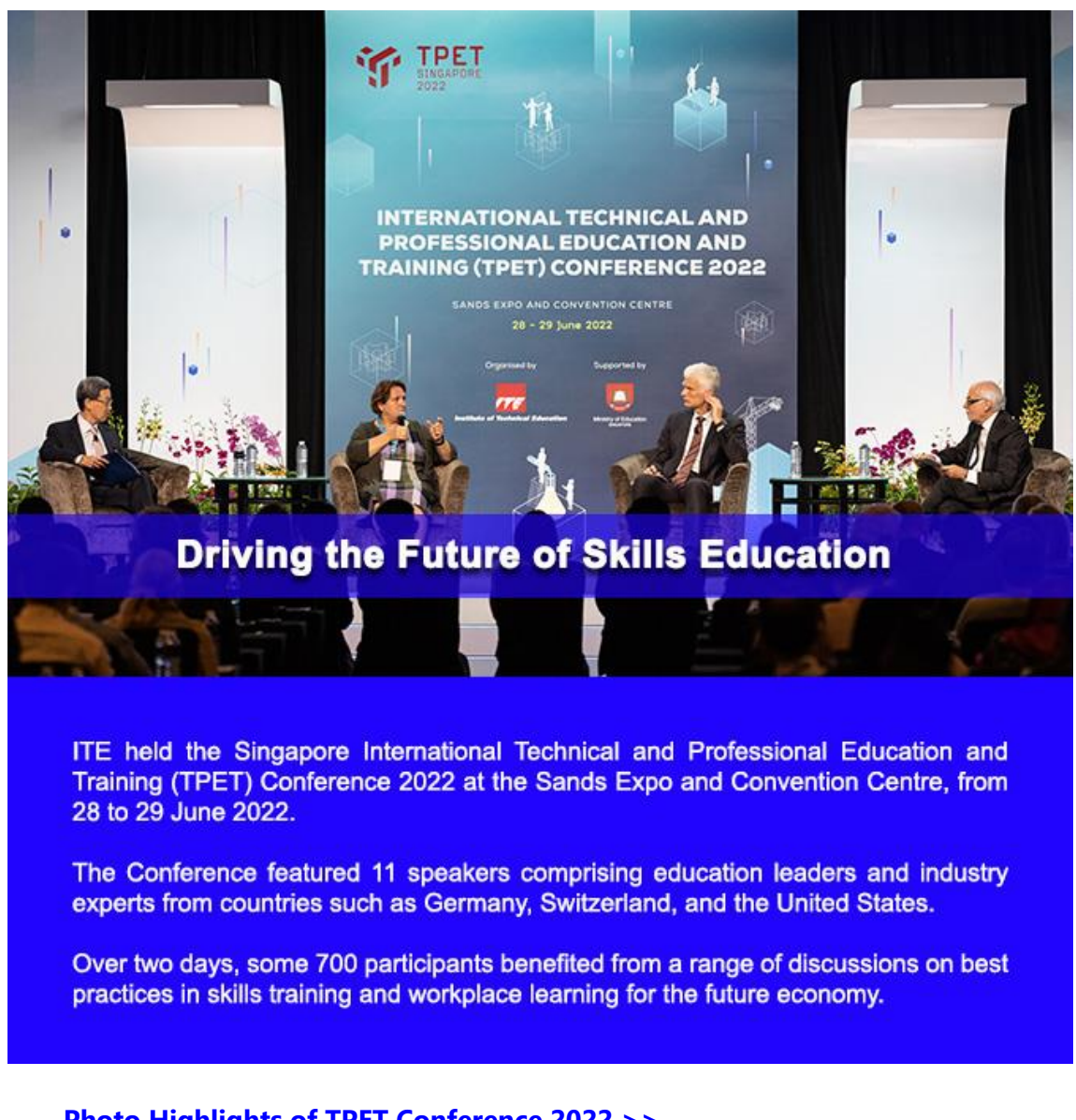
Photo Highlights of TPET Conference 2022 >> Video Highlights of TPET Conference 2022 >>